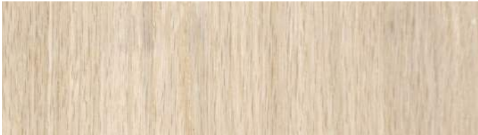
COASTAL - 206531