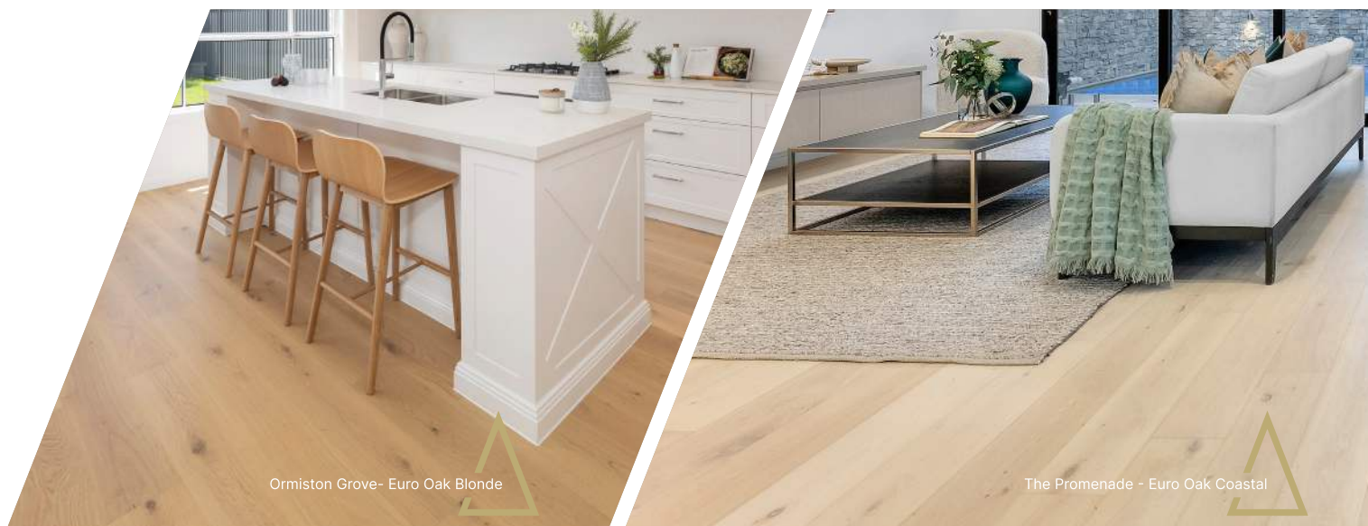
Ormiston Grove - Euro Oak Blonde

Each board features distinct knots and grain variations to create a unique look. The standard grade consists of a mixture of A, B, and C grades with features including knots, tiger stripes and sapwood for a truly unique finish.