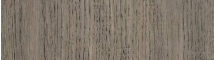
ASH - 206529