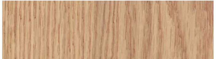
DESERT - 206530