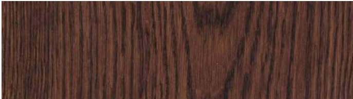
MOCHA - 206534