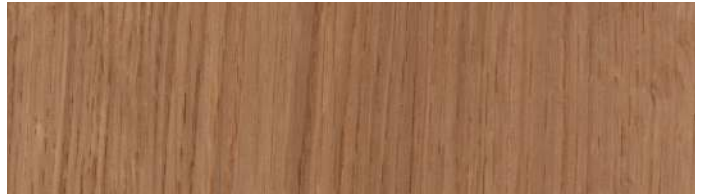
NATURAL - 205419