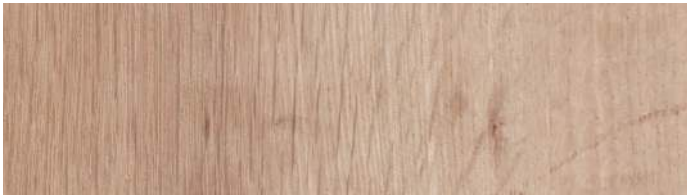
RAW - 205420