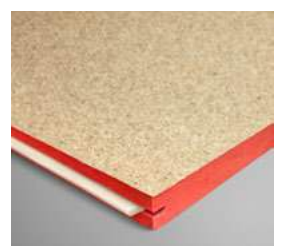
Termite Treated Beige Tongue - 22mm