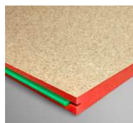
Termite Treated Green Tongue - 19mm