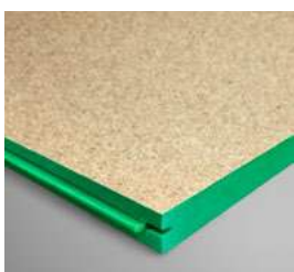
General Purpose Green Tongue - 19mm

EnduraFloor by Laminex Particleboard Flooring is also available in a Termite Treated option (identified with red wax sealed edges).