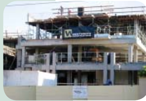
PLYWOOD HOARDING & SCAFFOLDING