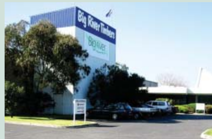
BIG RIVER TIMBERS (MELBOURNE)