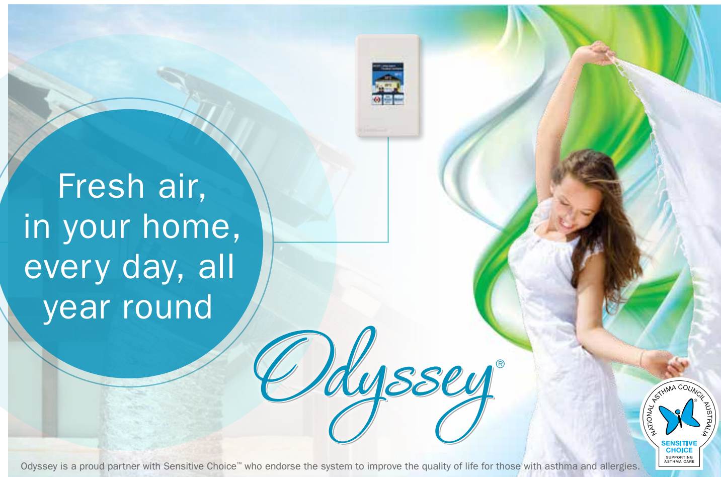
SupaVent – Roof space ventilation

For more information visit odyssey.com.au