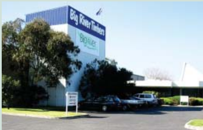
BIG RIVER TIMBERS (MELBOURNE)