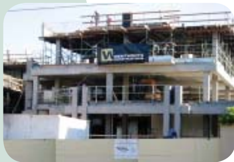
PLYWOOD HOARDING & SCAFFOLDING