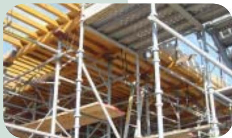
HYPLANK & TRUFORM